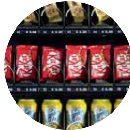
High visibility cell