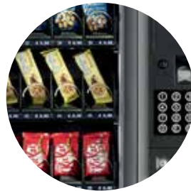
An elegant and uncluttered design